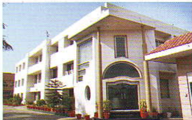
ADMIN BLOCK : SAFETY FOOTWEAR DIVISION

Our range of safety shoes comes in various types of designs including low, medium and high ankle. These shoes are crafted from in house genuine Leather Uppers with Direct Injection Polyurethane, Direct Molded Rubber vulcanized soles. They are given anti-bacterial & anti-fungal treatment. Their soft chrome leather/non-woven liner lining absorbs sweat to keep the feet cool and odour-free. The high ankle design reduces the risk of sprains and the alloy toe caps provide protection from heavy falling objects up to 200 joules.