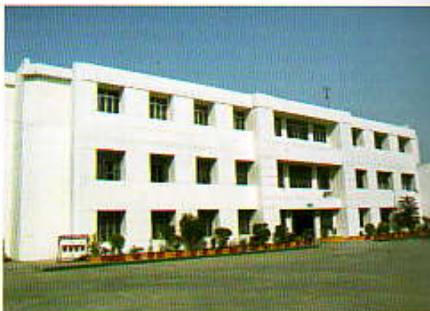
FACTORY - SAFETY FOOTWEAR DIVISION