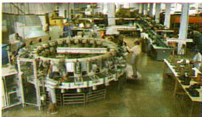
DESMA MAKE DIRECT INJECTION PU MACHINE