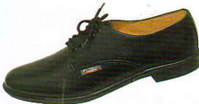
DERBY SHOES BLACK DMS